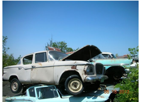
July 2012 Page 5