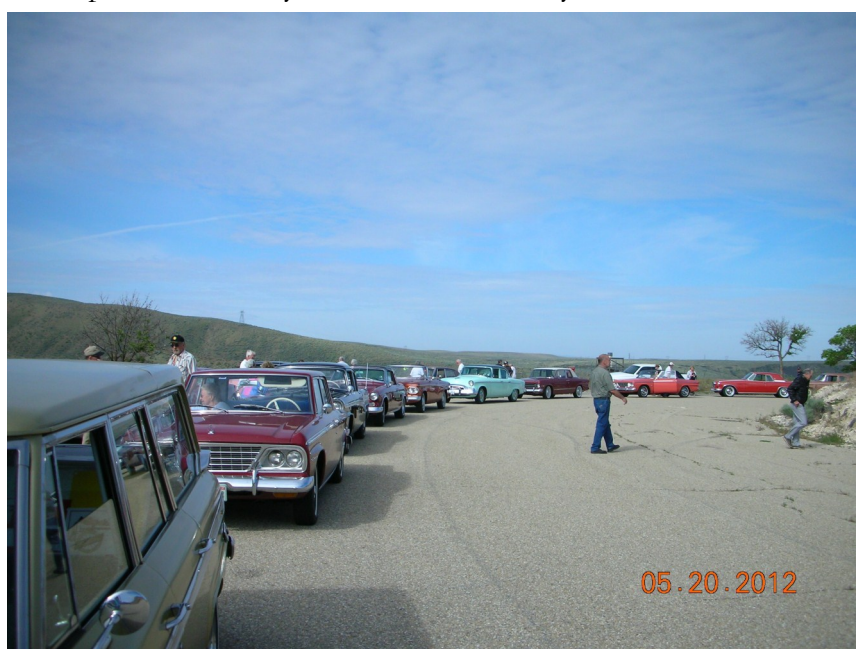
The Idaho Studebaker Overdrive hits the Road

An Idaho Junkyard and a few salvageable Studebakers; OR; Thar's gold in them thar Idaho Junkyards! (one man's trash . . .)