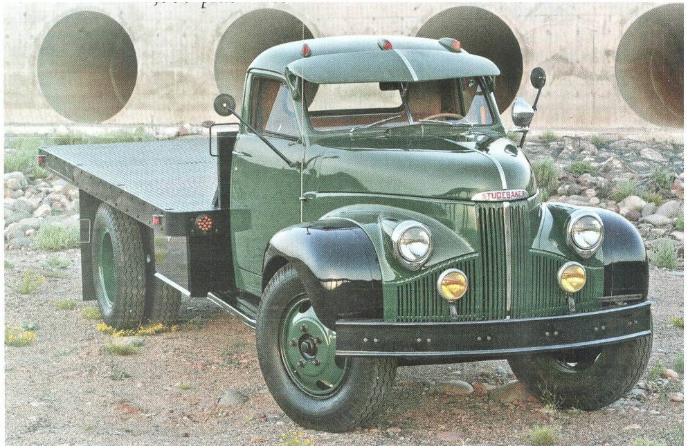
1946 M-16 Studebaker –one of an estimated 878 built in 1945. M production runs 1941 and through March 1948. An estimated total of 3, 044 M-16's were produced. In that time frame, 45% of all M-series production were M-16's !

"On the way, he decided to stop off at a Studebaker Salvage Yard to pick up a brake booster for the truck."