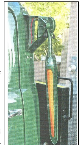
Period correct semaphore turn signal -just 1 was required!