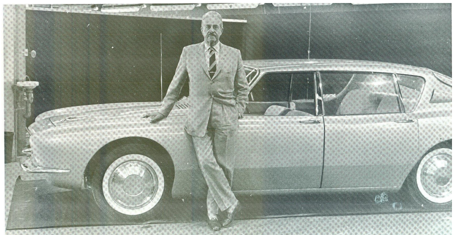
One Great Looking Studebaker

I can only wonder how that came to be, and why Enzo Ferrari, reput-