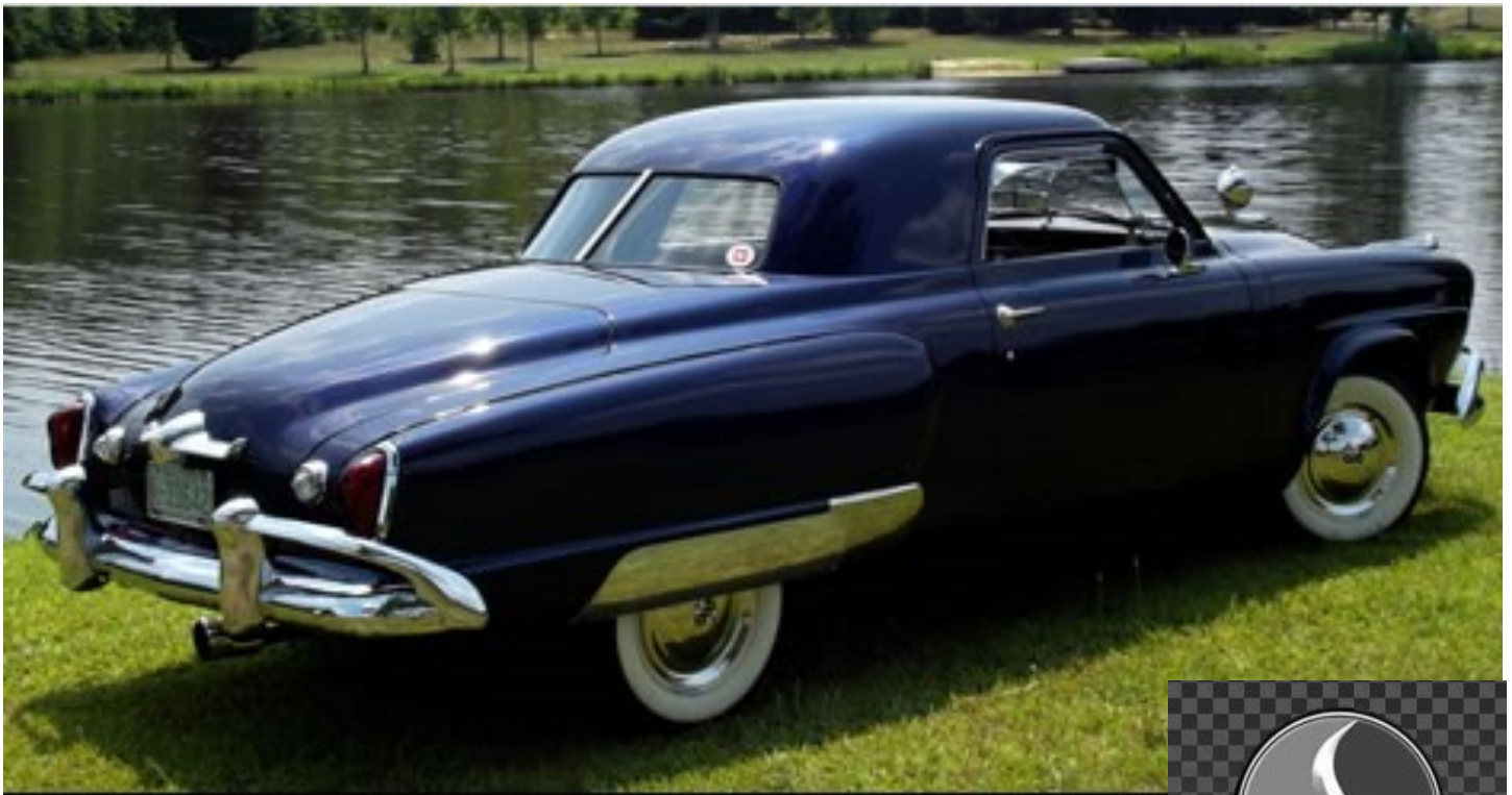
1951 Champion Business Coupe