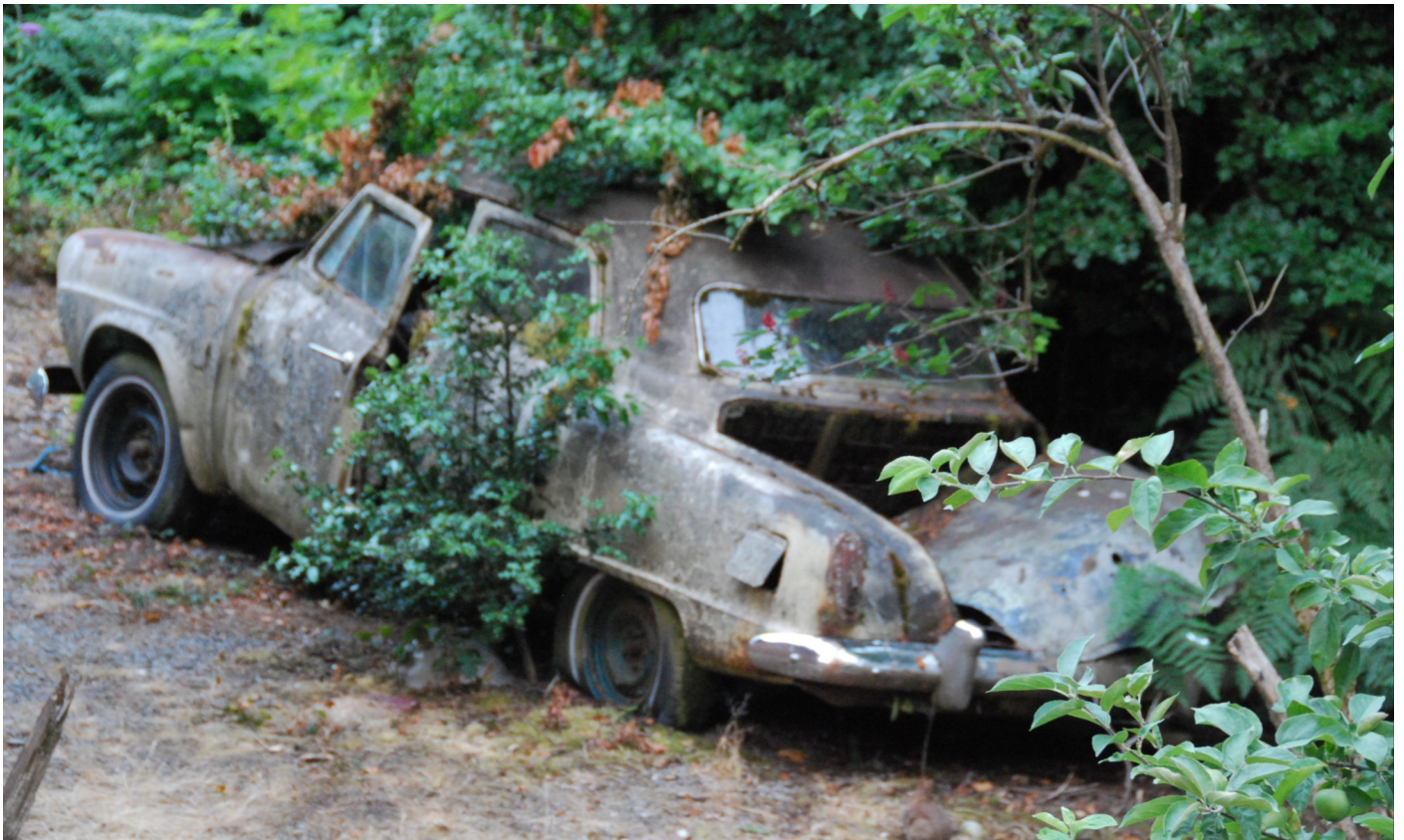
Another view of last month guess the year.