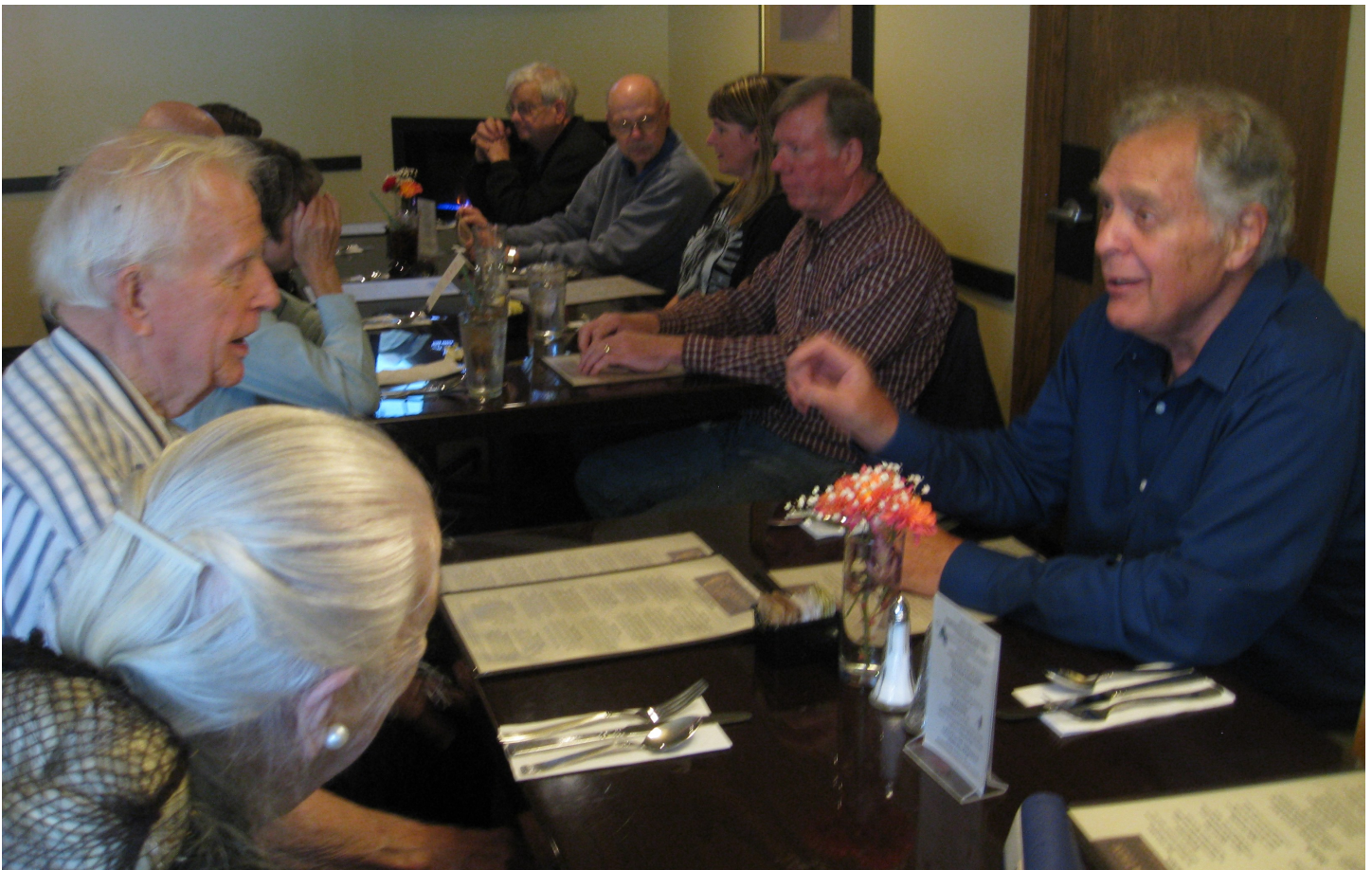
From our Fall Color Tour—Ready to enjoy dinner