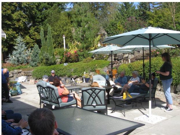
From our September meet