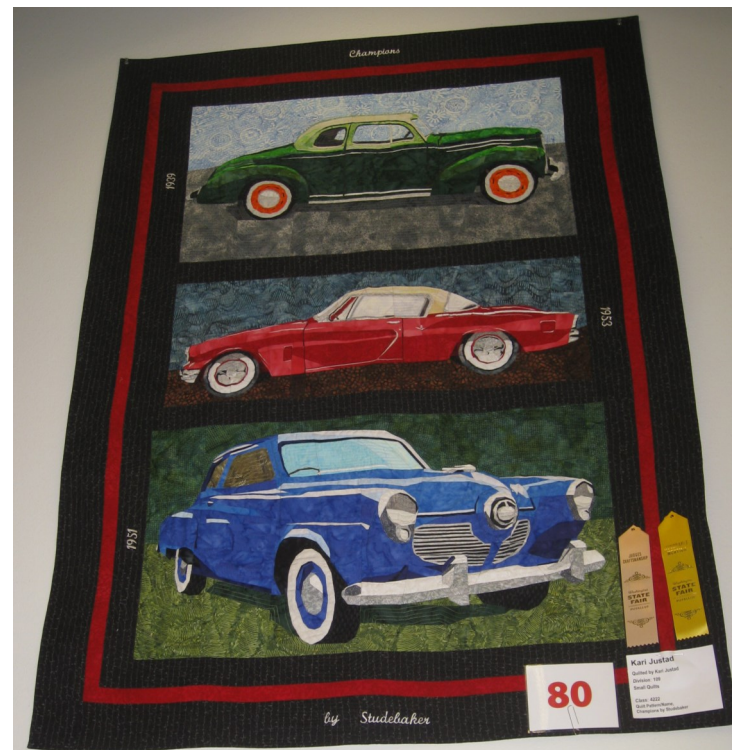
For those of you who missed the Puyallup fair

As I sit down to write this, I am seized by the realization of how important our hobby is to me. The cars bring us together, but it is much more than just the cars. It might seem trite, but it's more about the people who own them. Thankfully without politics, and personal differences, we seem be thriving. It was not always a foregone