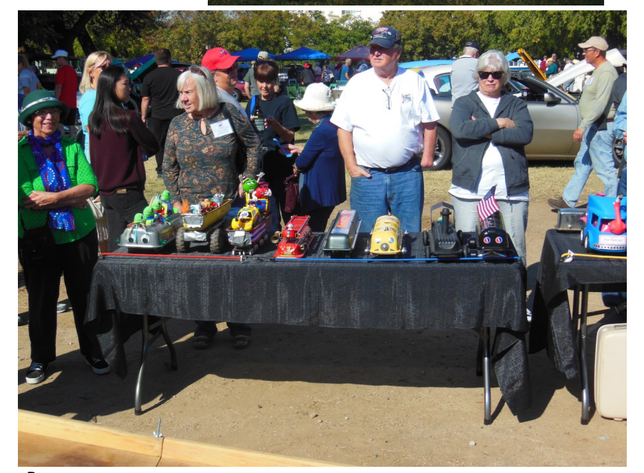
Underground tour and Valve Cover Race