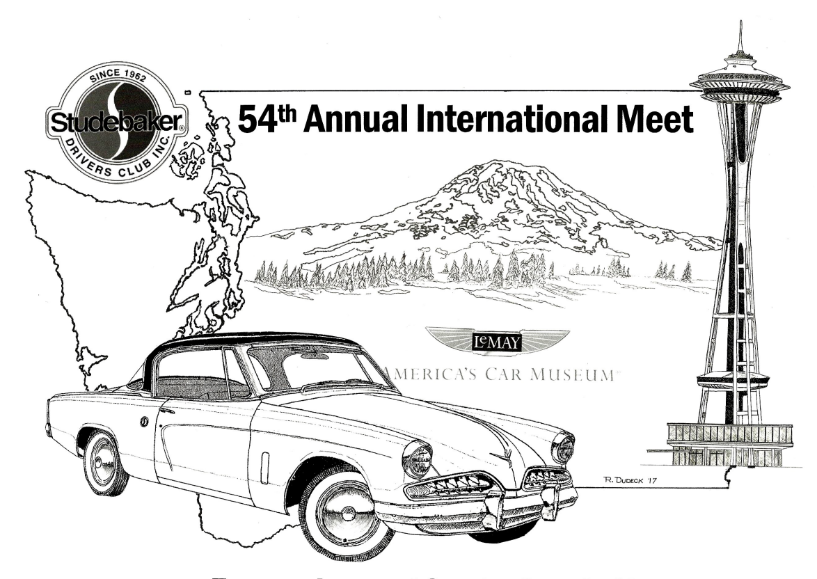
Tacoma Area and Greater Seattle Chapters