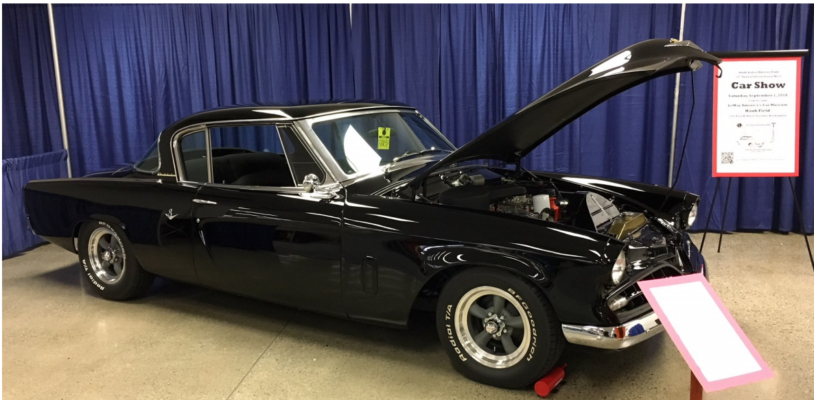
From Puyallup Early BirdSwap Meet