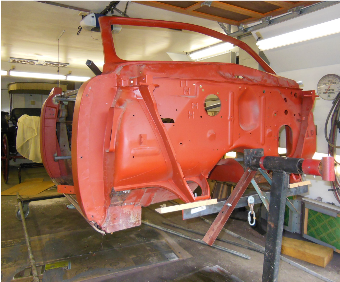
The body installed on the rotisserie. But first I will start in on the chassis

On the lighter side. NO, this is not a Norwegian joke