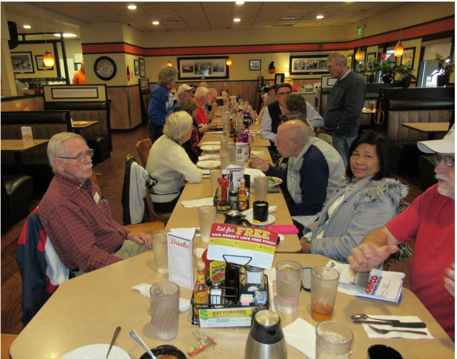
Dinner and birthday celebration at the "Country Pride" restaurant