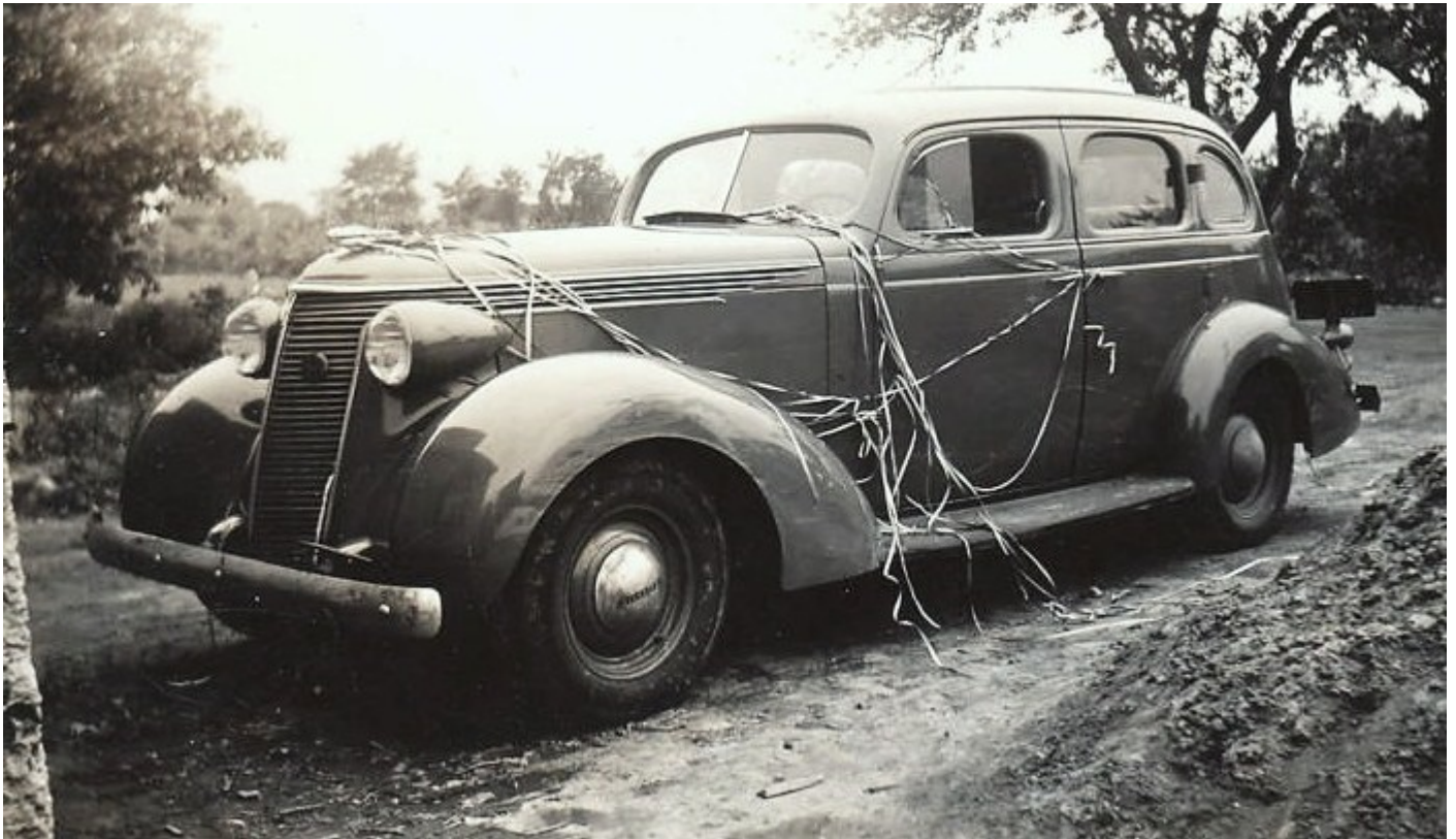
1937 Studebaker party car