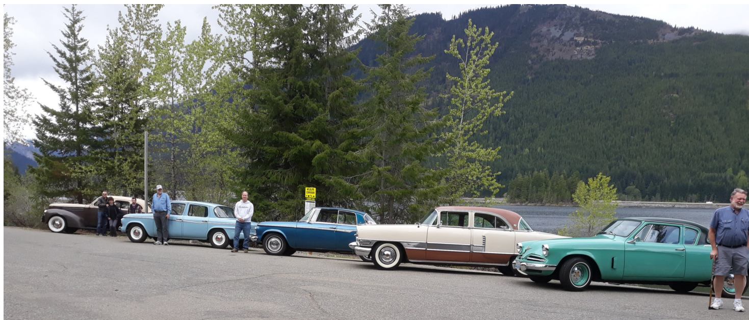
The group at Lake Keechelus

During this "stay at home" order, I've been getting