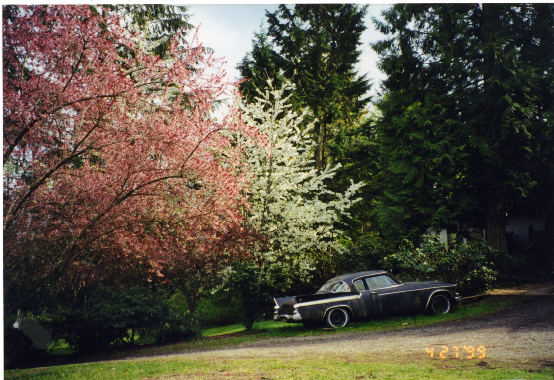
This is Mary's car taken shortly after she got it

That year when I got my income tax return of $400 I decided to buy a 5-window P/U. I got the Little Nickel and combed the old car section for weeks and there were no more 5-windows to be had. I continued to look, but to no avail. One day I was looking and