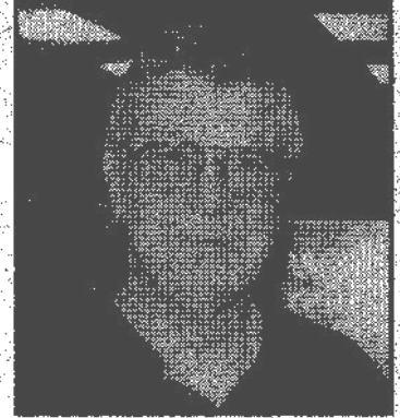
June 30, 1940 - March 15, 2021