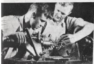
This Studebaker father instructs his son in the fine points of Studebaker craftsmanship. This is one of the many father and son teams for which Studebaker is famed.

for a Champion coupe delivered at the factory, subject to change without notice, C.I.T. terms.