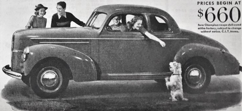
When you buy products advertised in this magazine you buy satisfaction