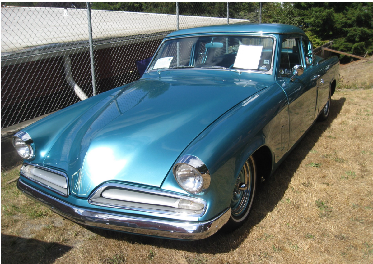
Saw this one at the Black Diomond meet