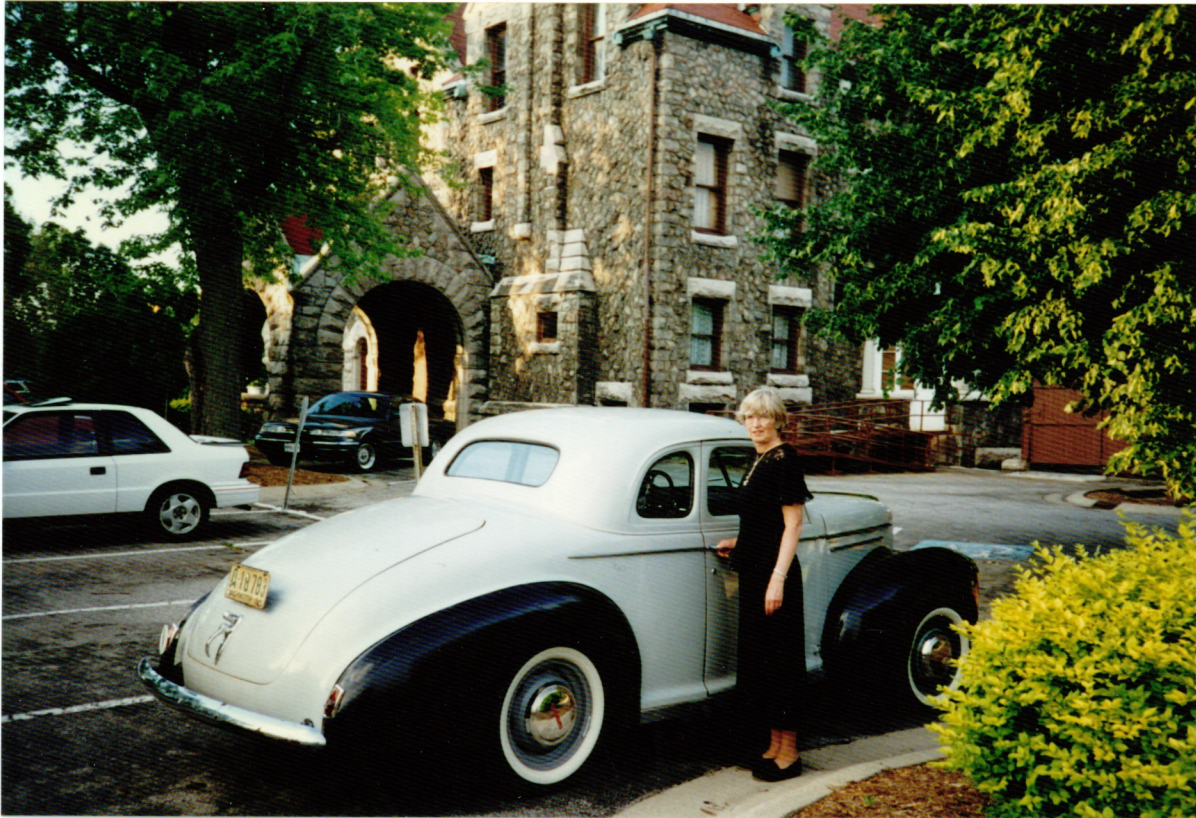
Final day in South Bend

June 28 5:45AM. We leave South Bend. Weather clear and warm. This time we will try toll road. Even paying for it does not guarantee good road. It wasn't worth the tolls. We leave Illinois and enter Wisconsin. Immediately come to nice rest stop. Still warm, though. Wisconsin pretty. We stop for night in Osseo, Wisconsin, three first motels are full, finally find one - place is a dump, but we are too tired to travel further. Eat at Norske Nook, rated as one of the best restaurants by somebody, but the food can only be described as terrible, and by no means Norwegian. Circuit breaker for motel room trips, can't find people to reset it, place locked up.