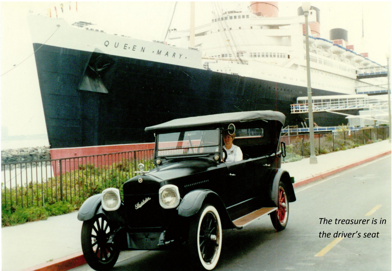
The treasurer is in the driver's seat